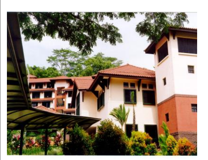
Hall of Residences